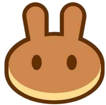
PANCAKE SWAP EXCHANGE